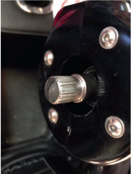
Steering column, wheel removed

The 5 Speeder has a steering wheel quick release (QR). This is disabled with an anti-tamper bolt when the car is supplied new from manufacturer. Most dealers point out to customers that the steering wheel can be quickly removed for easy access and the anti-tamper bolts are usually removed for this reason. This didn't seem to be a problem for many years when the quick release unit was supplied by a company called Lifeline. For some reason in April 2017 the QR unit was changed for one manufactured by a French company, Traven.