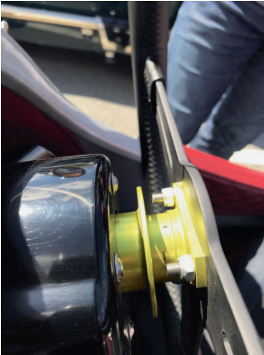
Traven quick-release assembly

The Traven QR has finer splines than the earlier Lifeline item; these splines seem to be poorly formed when examined closely. There is a wider master spline on both types of QR but the Traven one can be misaligned yet still allow the steering wheel to be partially fitted/wedged into place. Thus to the unwary the steering wheel can appear to be locked into position, when it isn't.